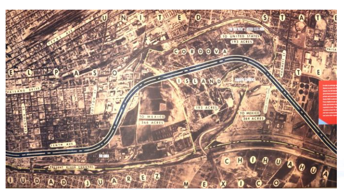
The swapped areas.

We also visited the Tigua Pueblo in Ysleta. At the Cultural Center, we enjoyed an exhibition of Tigua dance. The museum displays artifacts and pottery with photographs and videos representing 300 years of Tigua history since their move here from Albuquerque during the Pueblo Revolt of 1680.