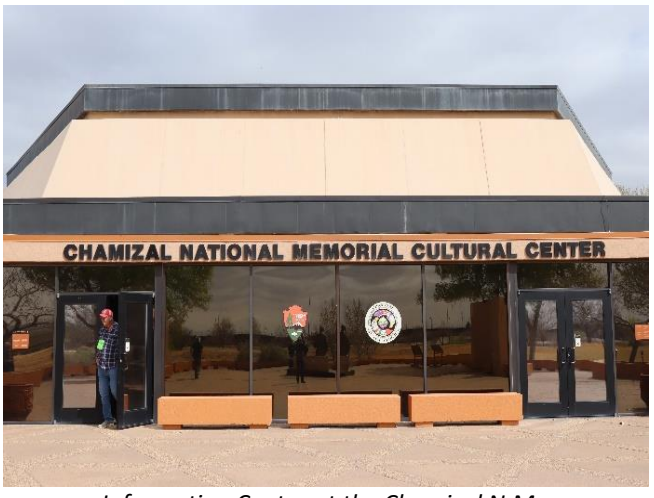
Information Center at the Chamizal N.M.

and the Chamizal National Memorial celebrating the successful land swap of 1963 that resolved a border dispute that had spanned 100 years.