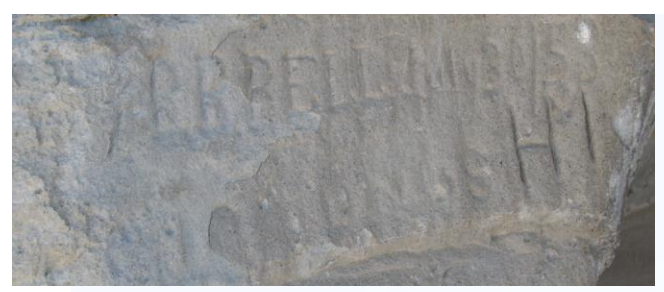
Names carved in ash sandstone at Record Bluff with recent graffiti.

We did a tour of the Jeffreys Route in INL a couple of years ago. We would like to go back to see more of the area and possibly find the emigrant graves along the Lost River.