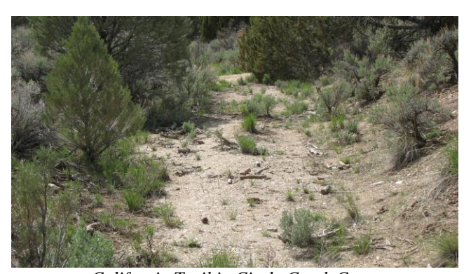
California Trail in Circle Creek Canyon

On Friday, May 17, we will do metal detecting on the California Trail going up Circle Creek Canyon into the park. This is a section of the California Trail we found last year. It has excellent ruts and some rough trails. It will involve a half-mile hike from the main road in the park. Of course, any artifacts found will be tagged, bagged, and given to the City of Rocks people for display in the visitor center.