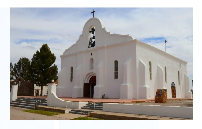
The Historic District here also contains a Butterfield Stage Station, though now a private residence.

The Presidio Chapel of San Elizario was the first of these.